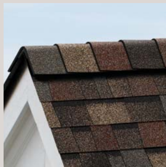
Summer Harvest †

RIZERidge® Hip & Ridge shingles also coordinate with the TruDefinition® Duration® Designer Colors Collection—this unique color-blended application is only available from Owens Corning Roofing.