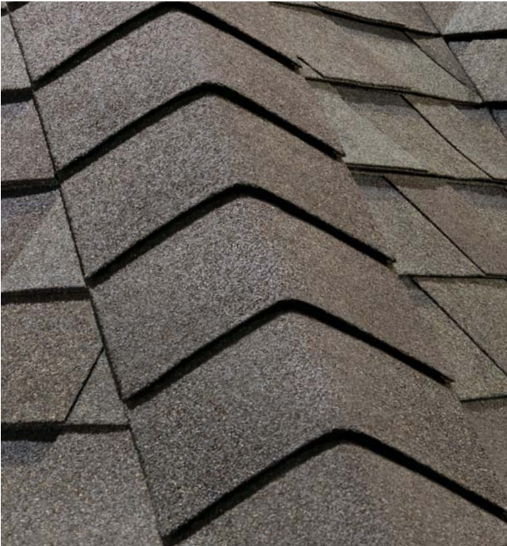
RIZERidge® Hip & Ridge Shingles

RIZERidge Hip & Ridge shingles offer a stylish higher profile and more consistent look compared to cut-tab shingles.